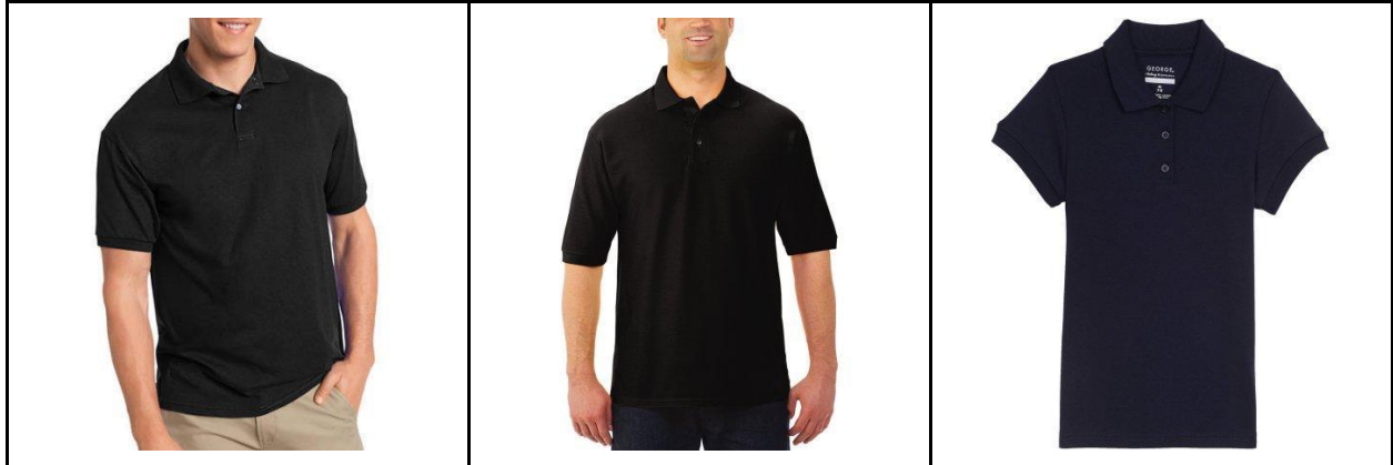
Solid black Polo shirt without pockets or logo on shirt. (for girls and boys)