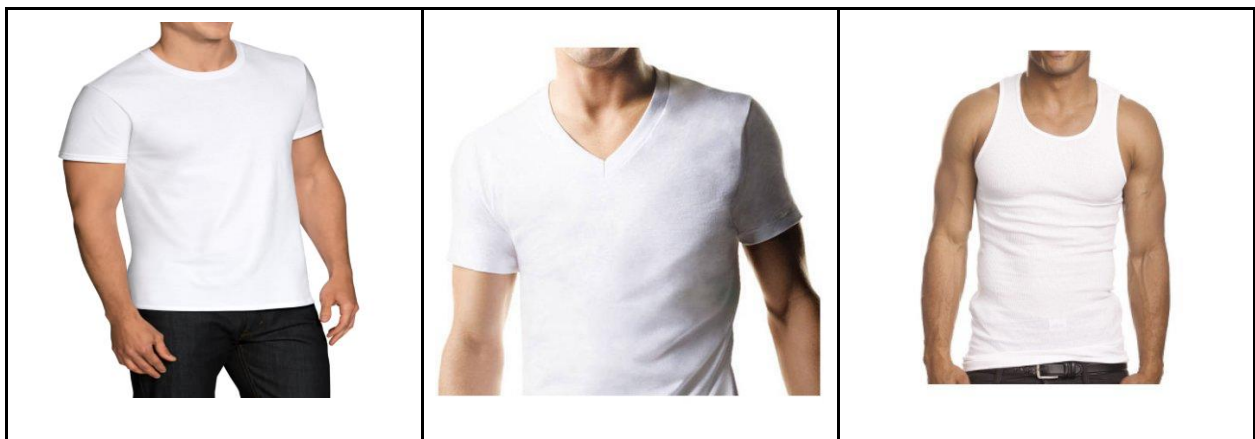
Acceptable WHITE undershirts that can be worn under the shirt for boys.