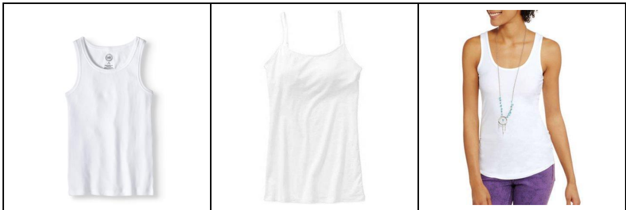
Acceptable WHITE undershirts that can be worn under the shirt for girls. Bras must be solid color and not visible through the shirt.