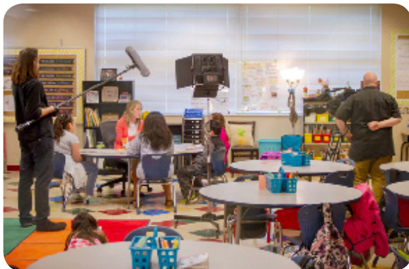
A Georgia Public Broadcasting film crew recorded a Cedar Ridge Elementary teacher during class to be used in a case study for professional development across Georgia.