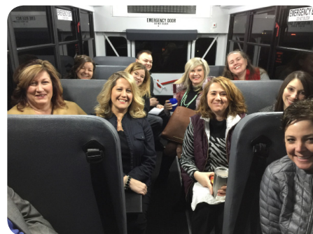
Middle school administrators, district coaches and school coaches traveled to a Heinemann literacy workshop in Atlanta.

82% of teachers have earned advanced degrees