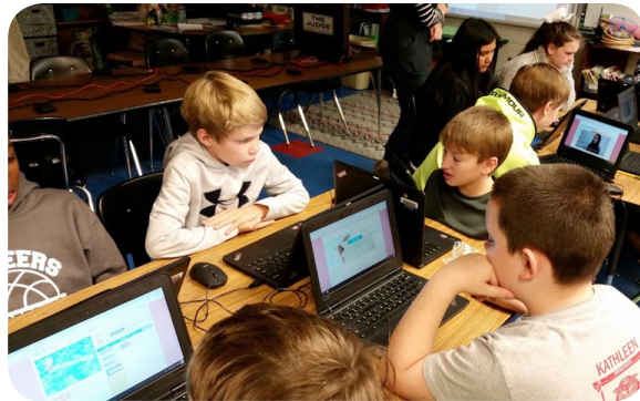
Varnell Elementary students using Chromebooks to code.

800 internet-capable devices added last year